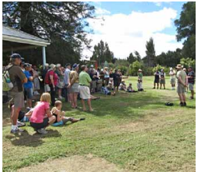
» Guests listen as the Pahi walkway is launched. This walkway was one of the first successful applicants to the New Zealand Walking Access Commission's Enhanced Access Fund when it was launched last year.